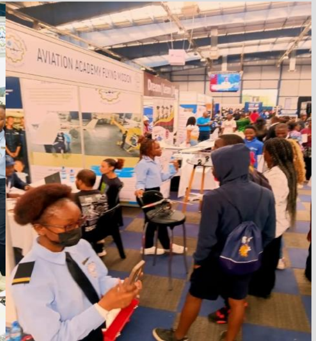
Above are some of pictures taken at FM-AMETS stalls