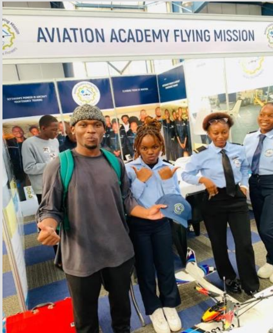
Above are some of pictures taken at FM-AMETS stalls

Our students, in particular, represented the academy with confidence and positive energy.