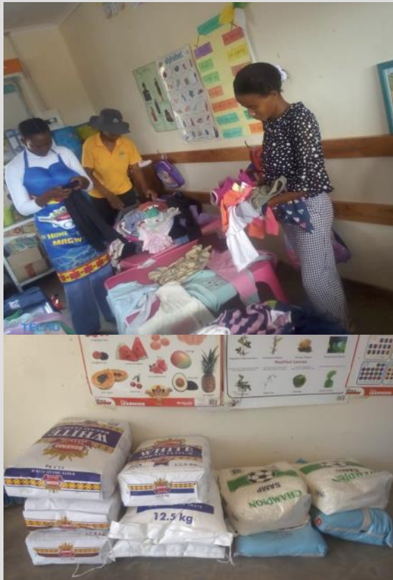
Donated clothes and food

March marked a significant milestone for Rerotlhe. The school received its operating license on 5 March and opened just four days later, on 9 March . During a follow-up visit, we were joined by a representative from a local organization interested in partnering with us. Their generous donation of food supplies and clothes was a great blessing, and we are hopeful this will lead to ongoing collaboration.