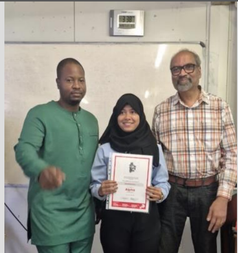
Awarding of Certificates