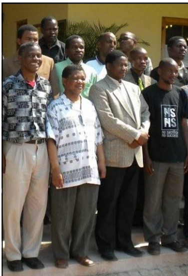
Local pastors gather for a seminar on Biblical preaching

"This seminar was a vital step in encouraging growth among the pastors which in turn will grow the local church," said one pastor.