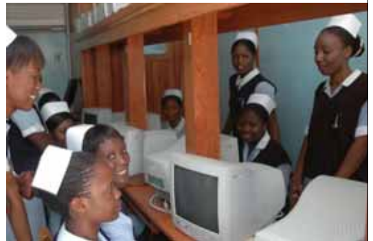
...Linknet plans to open 7 units in 2008! FMZ will be alongside...

The internet facilities are available to medical personnel and the local community. They are bringing new horizons to many people groups living and working in rural places.