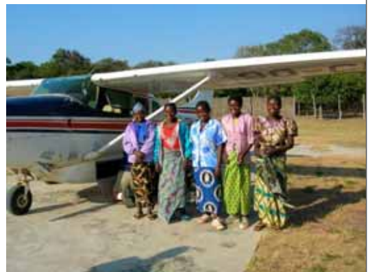
...No wonder they look happy ...

A few days later, when the 5 had had surgery, the other 4 ladies arrived by road in time to get into the operating theatre before the surgeon had to leave! Good communications and the availability of a plane and pilot won the day. No wonder they look happy! They have a much brighter future to look forward to now.