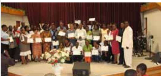
46 graduates showing their certificates