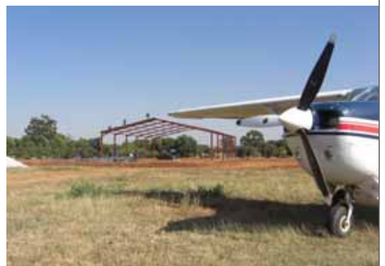
...In Chilongolo a new hangar is being erected...