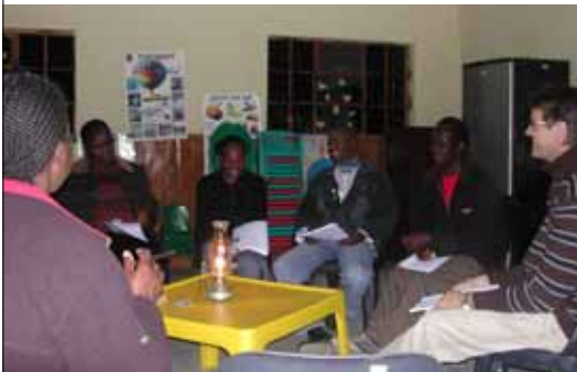
'Life to the Full' meeting with paraffin lamp