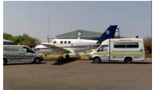
...we dedicated this ambulance to God for serving ill and injured Batswana...