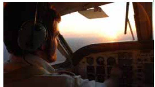
...FMS reopened its Maun base on third January...