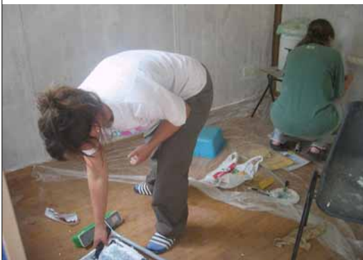
...the transformation of an old office room into a peaceful, beautiful place...