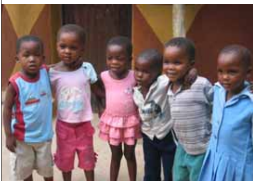
...I assist with preparing breakfast and lunch, help by teaching the children numbers, play and sing with them...

The Community Relief Day Care Centre (CRDCC) was established in Tlokweg by BORNUS (Botswana Retired Nurses Association) in 2003. The main goal of the centre is to provide comprehensive quality health care and support to chronically and terminally ill clients including HIV/AIDS patients, as well as orphans, vulnerable children and the elderly, who are mostly caregivers. In addition, the Centre exists to relieve the burden of care on caregivers and the affected families.